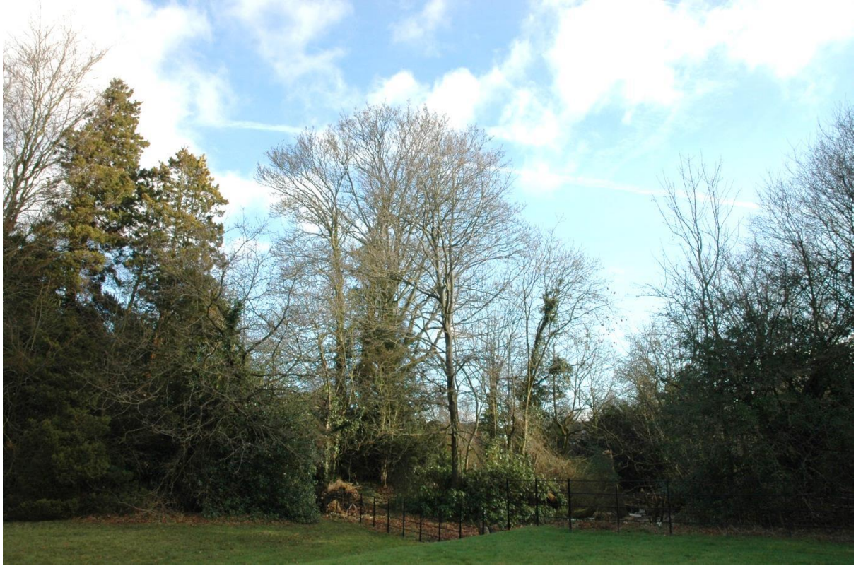
Sycamore in their setting