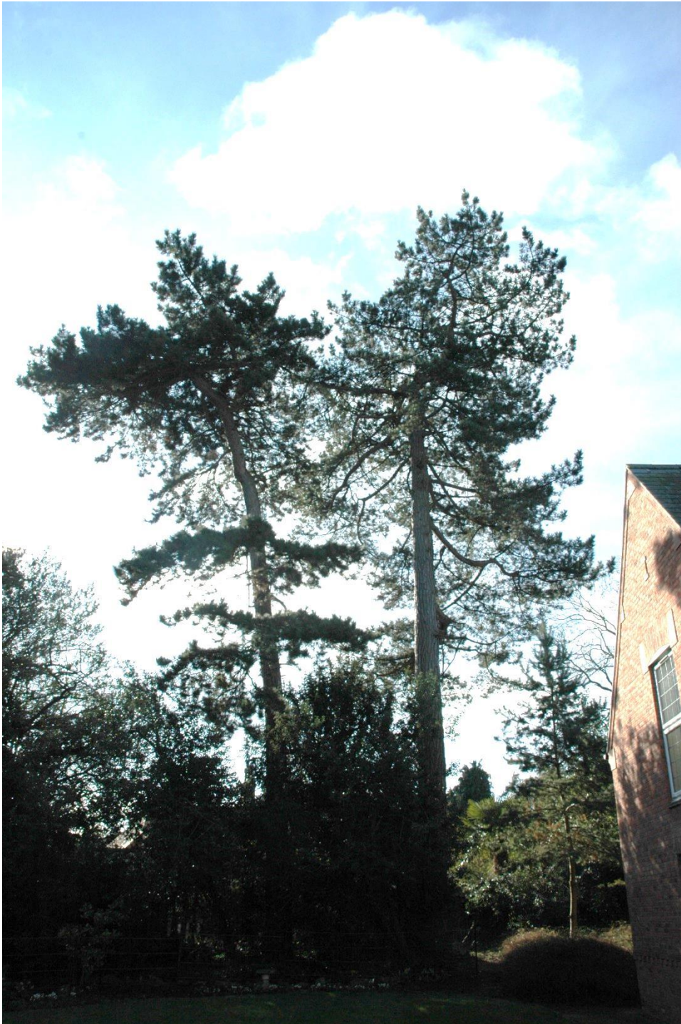
Pines in setting